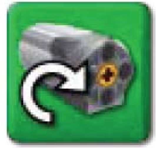
Motor This Way Block