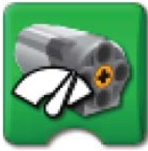
Motor Power Block