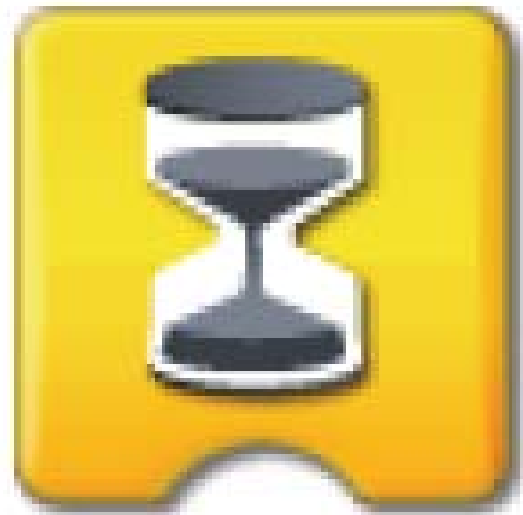
Wait For Block