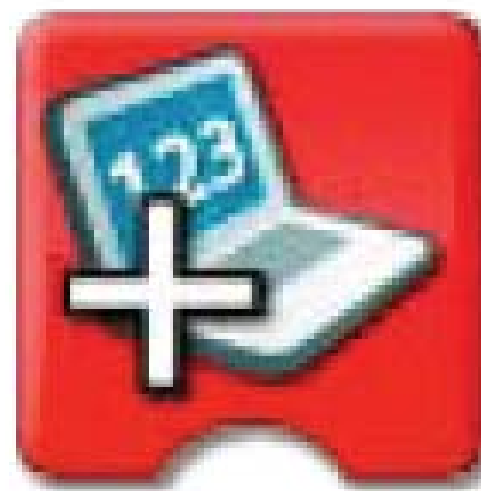
Add to Display Block