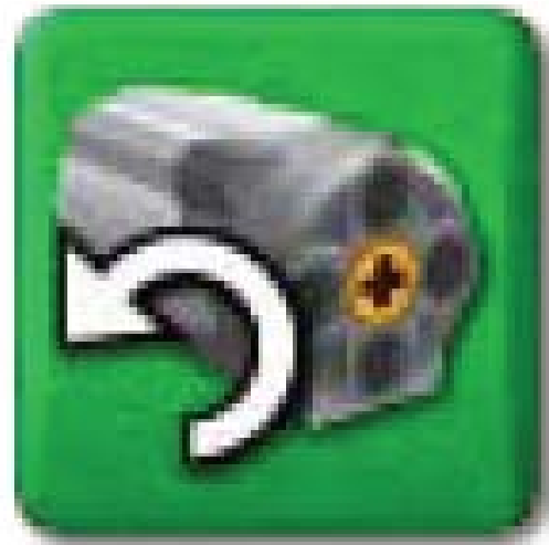
Motor That Way Block