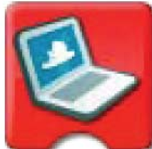
Display Background Block