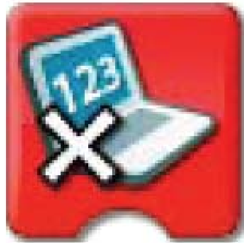
Multiply by Display Block