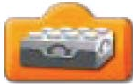
Tilt Sensor Input