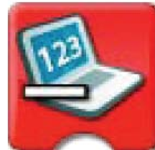
Subtract from Display Block