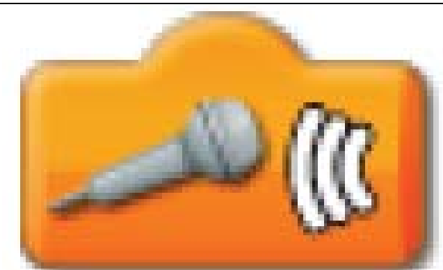
Sound Sensor Input