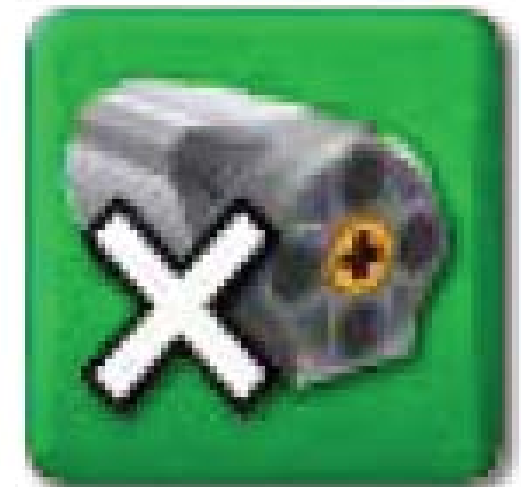
Motor Off Block