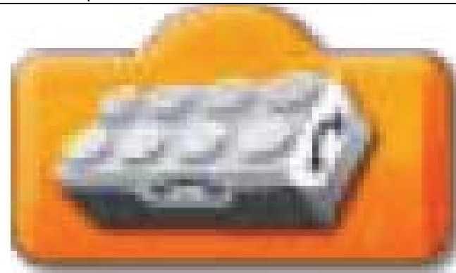
Tilt This Way