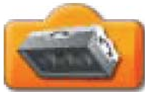
Tilt That Way