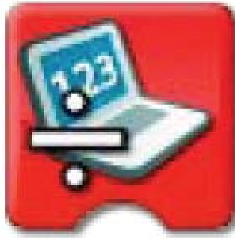
Divide by Display Block