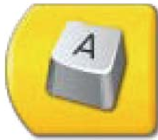
Start On Key Press Block