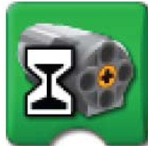
Motor On For Block