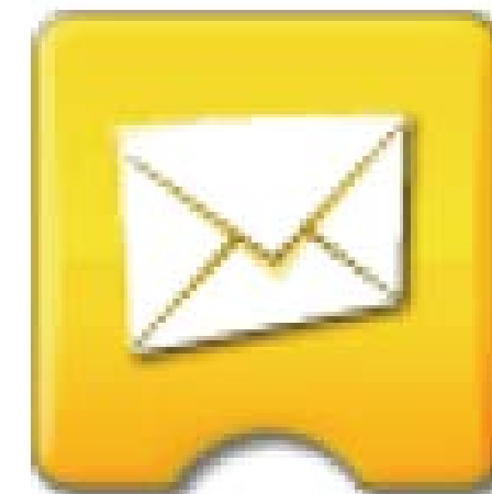
Send Message Block