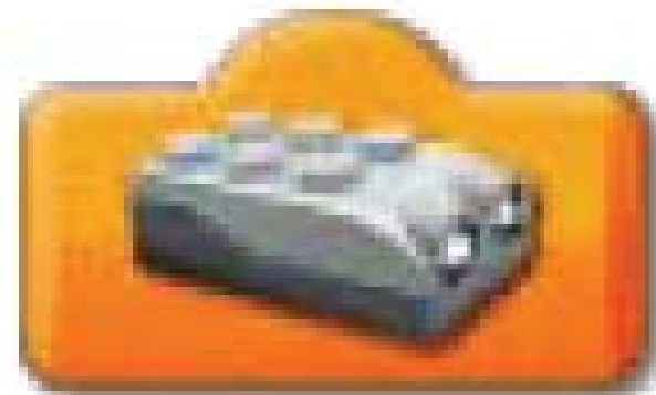
Motion Sensor Input