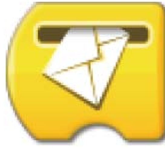
Start On Message Block