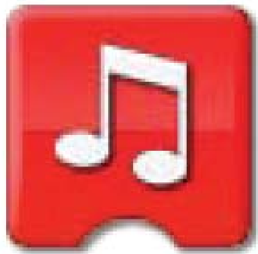
Play Sound Block