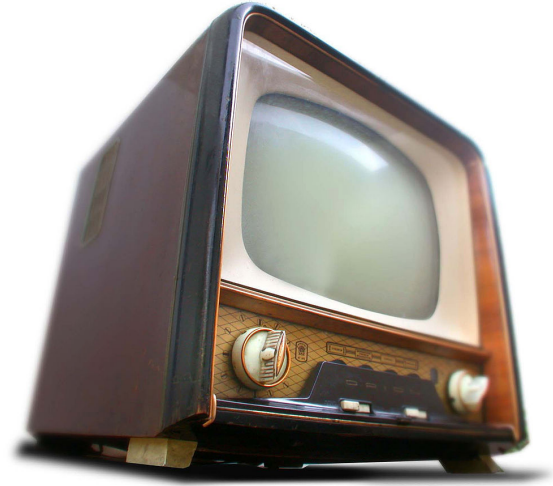
Figure 3: The television has contributed to decreased physical activity among children